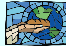
World Communion Sunday

World Communion Sunday, celebrated this year on October 6 , reminds us there's no such thing as solitary Christianity. "As Christians we're called to belong, not just to believe," writes Rick Warren. "We are not meant to live lone-ranger lives; instead, we are to belong to Christ's family and be members of his body."